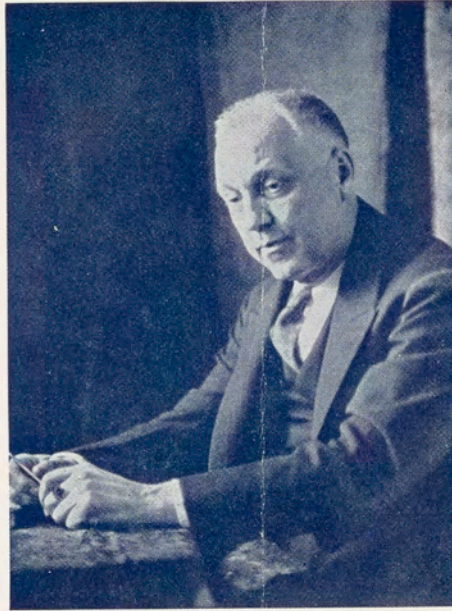
CLAUDE BRAGDON