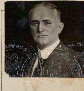
Duplicate passport application (1916)

A duplicate of the photograph attached to the original application must be affixed in the space marked below.