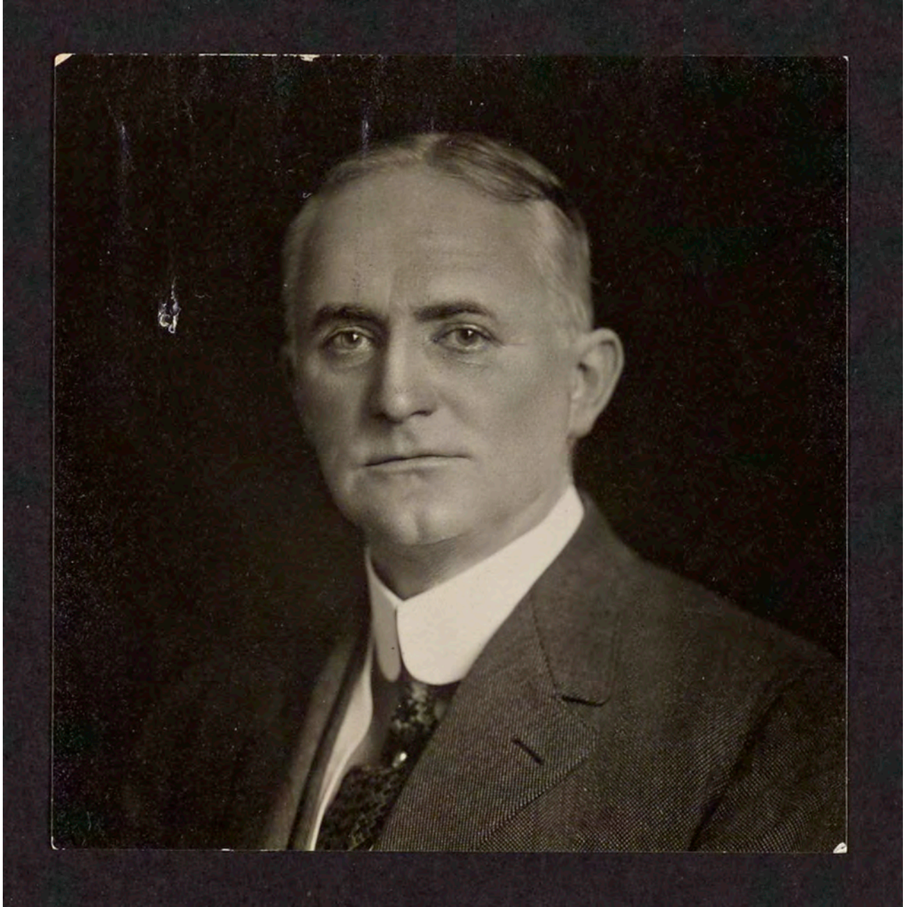
Duplicate passport application (1916)